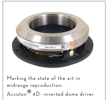
Marking the state of the art in midrange reproduction: Accuton® 4D- inverted dome driver

Lyravox is known for wholistic audio systems in favour of perfect acoustics. Based on the best possible loudspeaker as the physical generator of the sound, the chain of its amplifier, the signal feed into the amplifier, and the processing frontend form a lossless and perfectly coherent system. This whole integral chain is devoted to the achievement of a perfect stereophonic projection. That's why to Lyravox a consequently integrated speaker needs to be the actual audio system.